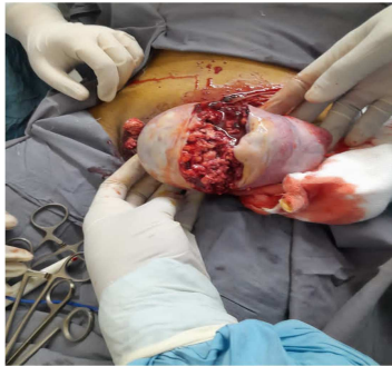
Figure 1. Intra-operative, Ruptured Testicular Seminoma, Female, Ambiguous Genitalia, Dr. Sulman Alamin Medical Center, Gezira State, Sudan; 2023.

testis or an ovary, (3) Buccal biopsy for sex determination and (4) Surgery, for the right side, if needed.