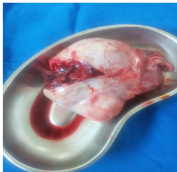
Figure 2. Ruptured testis, Testicular Seminoma, Female, Ambiguous Genitalia, Dr. Sulman Alamin Medical Center, Gezira State, Sudan; 2023.